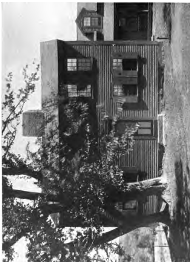
THE OLD HOUSE AT FRUITLANDS, HARVARD, MASSACHUSETTS